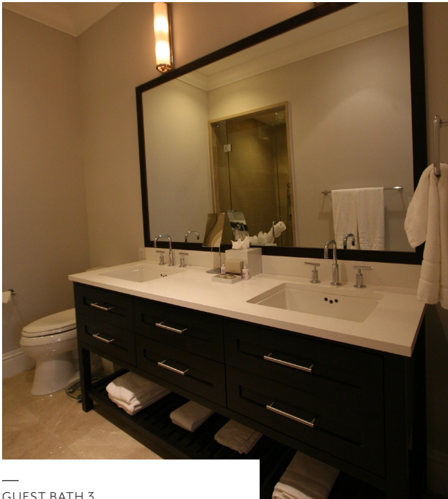
GUEST BATH 3