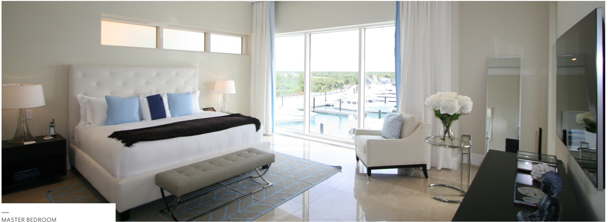
— MASTER BEDROOM