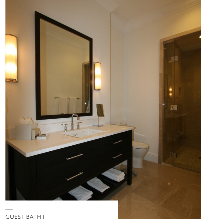
GUEST BATH 1