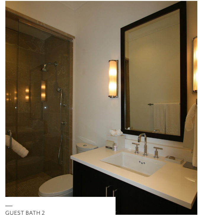
GUEST BATH 2