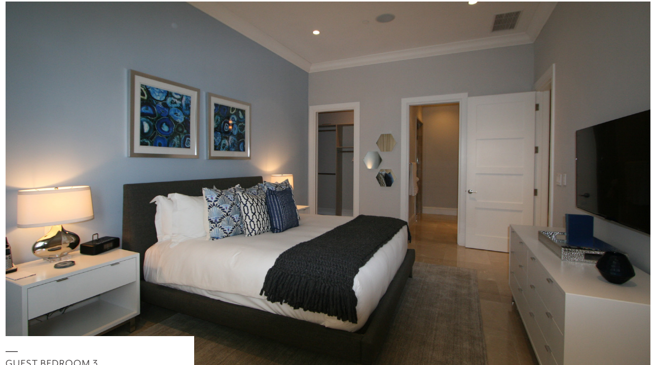
GUEST BEDROOM 3