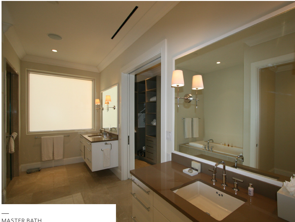
— MASTER BATH