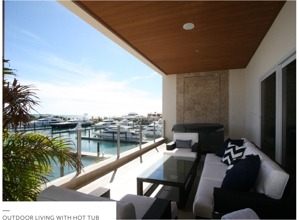
— OUTDOOR LIVING WITH HOT TUB