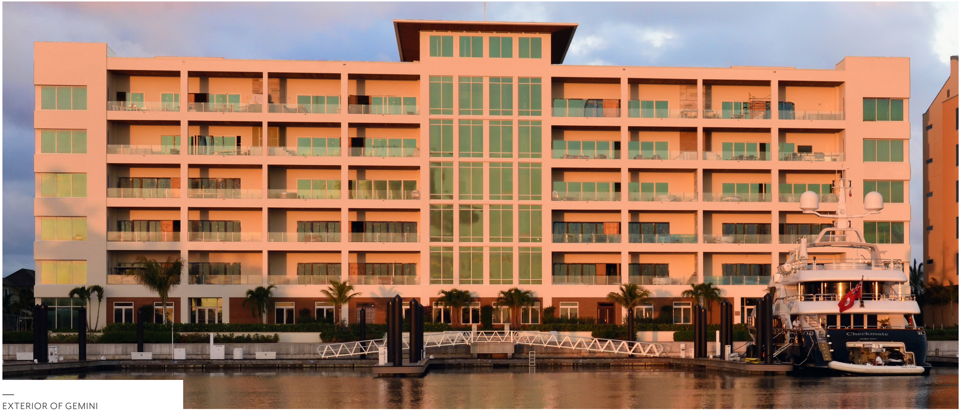
EXTERIOR OF GEMINI