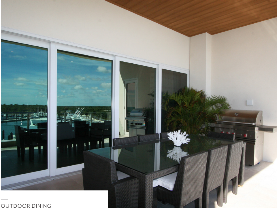
— OUTDOOR DINING