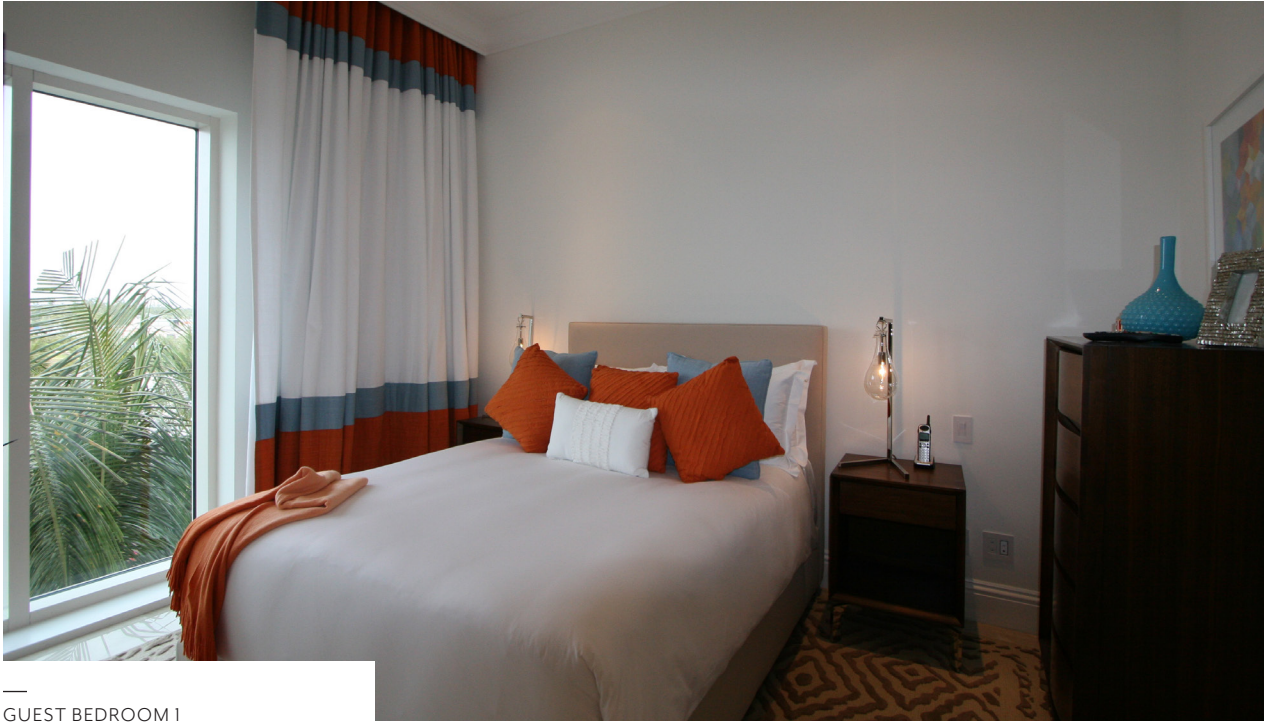
GUEST BEDROOM 1