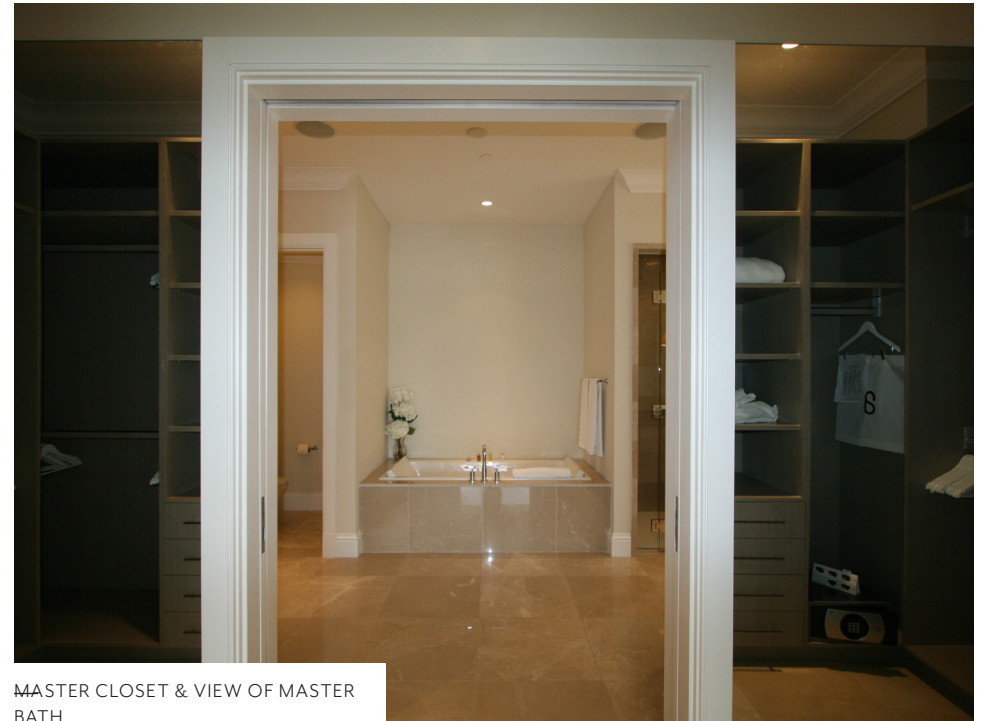
MASTER CLOSET & VIEW OF MASTER BATH