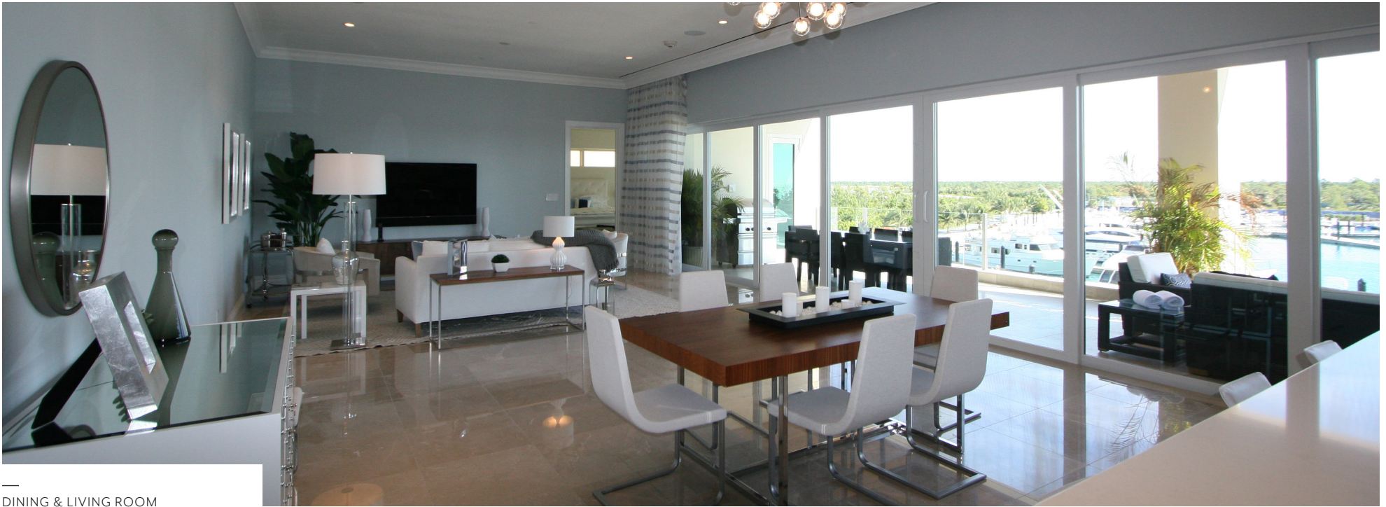
DINING & LIVING ROOM