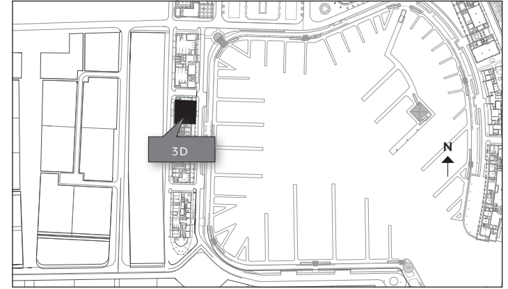
GEMINI Building, Unit 3D

To book your holiday at Albany, please contact Resort Services at 242-676-6012 or hotel@albanybahamas.com